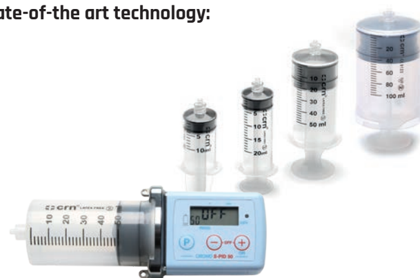
Crono S-PID 50 for subcutaneous immunoglobulin therapy