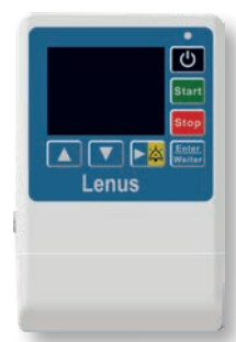
Lenus infusion pump(s) for pain therapy or chemotherapy / nutritional therapy