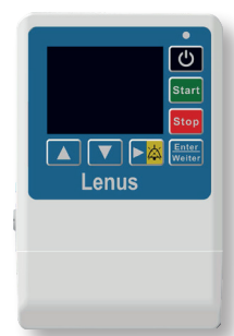
Lenus infusion pump(s) for pain therapy or chemotherapy / nutritional therapy