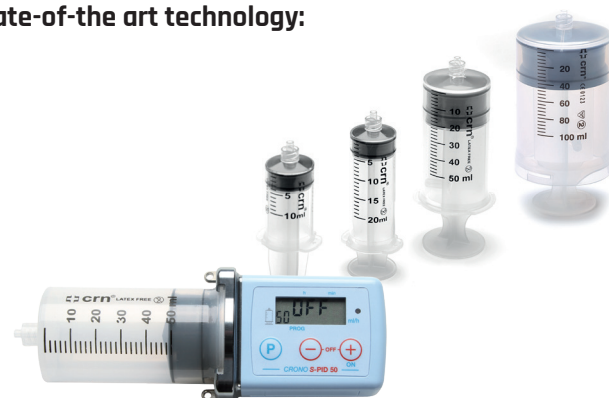
Crono S-PID 50 for subcutaneous immunoglobulin therapy